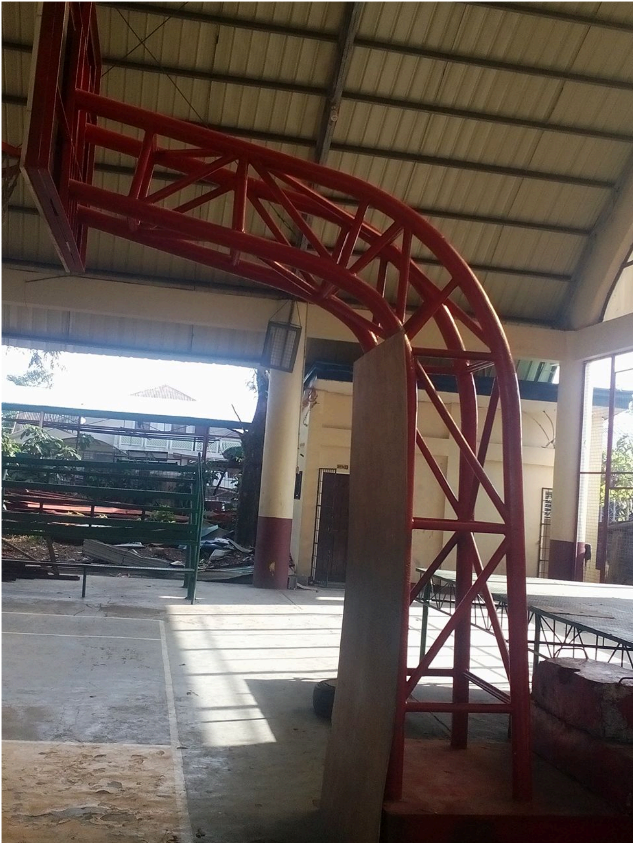
PICTURE OF BASKETBALL GOAL

Main Campus Bongabong Campus Calapan City Campus Alcate, Victoria Labasan, Bongabong Masipit, Calapan City e-mail address: minscat_main@yahoo.com Mobile No. +639178156228 T/Fax No. (043) 2862368