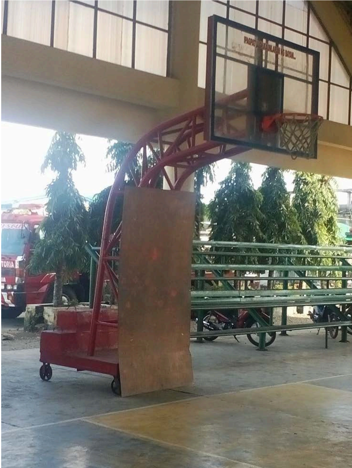
PICTURE OF BASKETBALL GOAL

Main Campus Bongabong Campus Calapan City Campus Alcate, Victoria Labasan, Bongabong Masipit, Calapan City e-mail address: minscat_main@yahoo.com Mobile No. +639178156228 T/Fax No. (043) 2862368